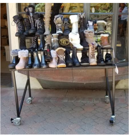
Approved BC Rack